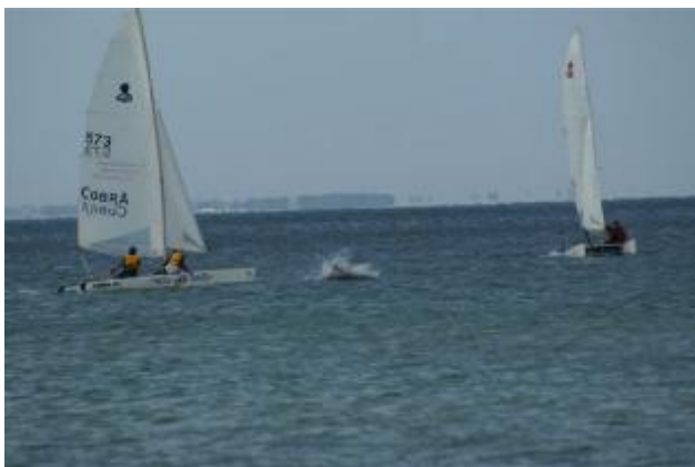
Above: Dolphins are playing with the cobras At Portarlington.